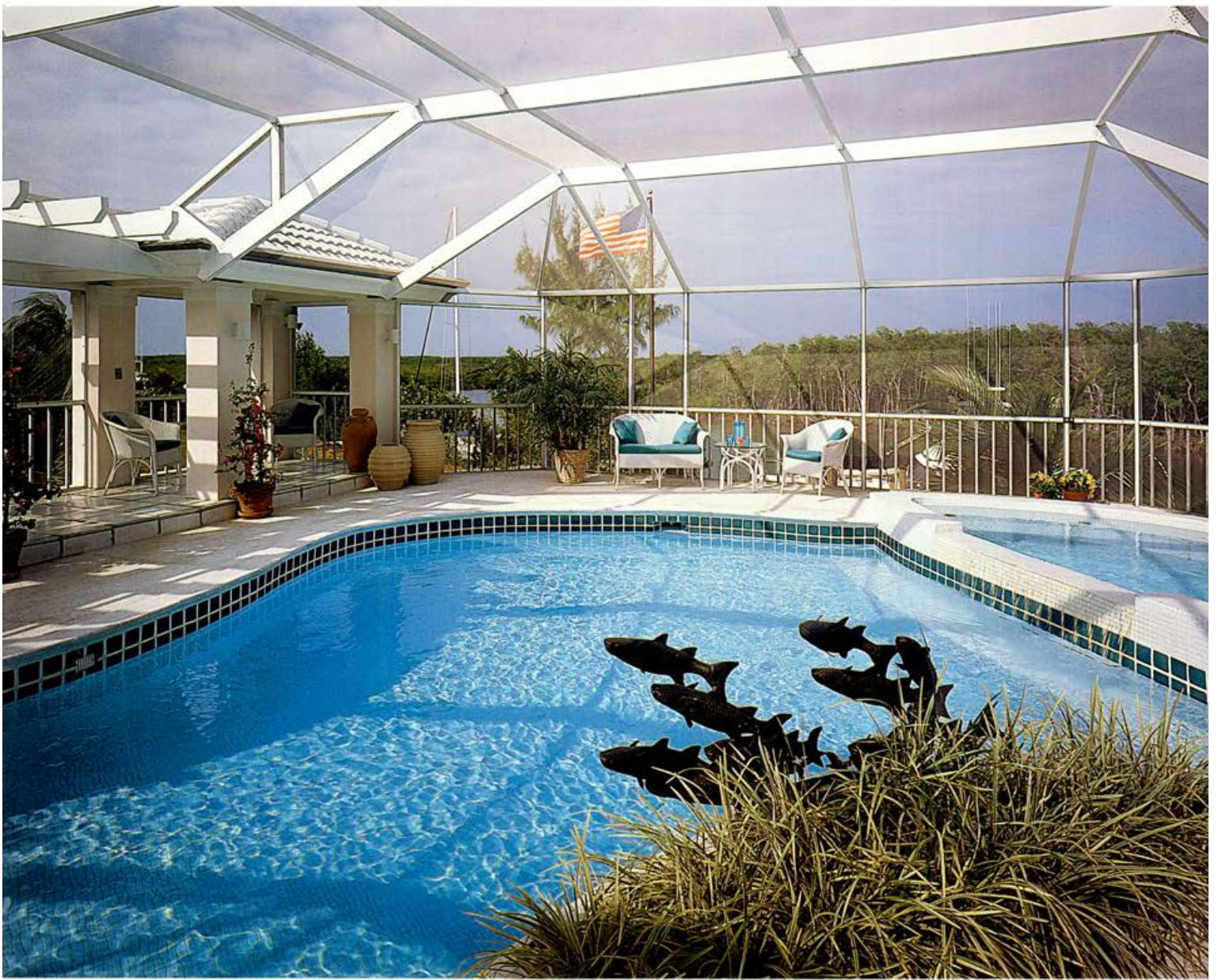
The outdoor patio includes a trellised arbor and gazebo overlooking the pool and spa. An imported metal fish sculpture adds a zestful flair.

kitchen is separate from but open to the great room. This plan allows interaction between the two rooms and is particularly convenient when entertaining. All-white cabinetry and countertops are in keeping with the crisp, clean look of the house. A sliding glass doorway opens to bring in the joyful outdoor scene while refreshing breezes circulate. The open, cheerful atmosphere makes this convivial spot a favorite for the owners and their family and guests. With its flowing transition from the house, the outdoor patio expanse actually becomes an extended living area for the owners. A trellised arbor runs alongside the patio and leads to a garden gazebo. Attached to the arbor and gazebo is a screen enclosure which angles high above the swimming pool and spa, and connects to the house. A spacious deck surrounds the inviting, free-form pool and spa, and provides ample space for outdoor seating.