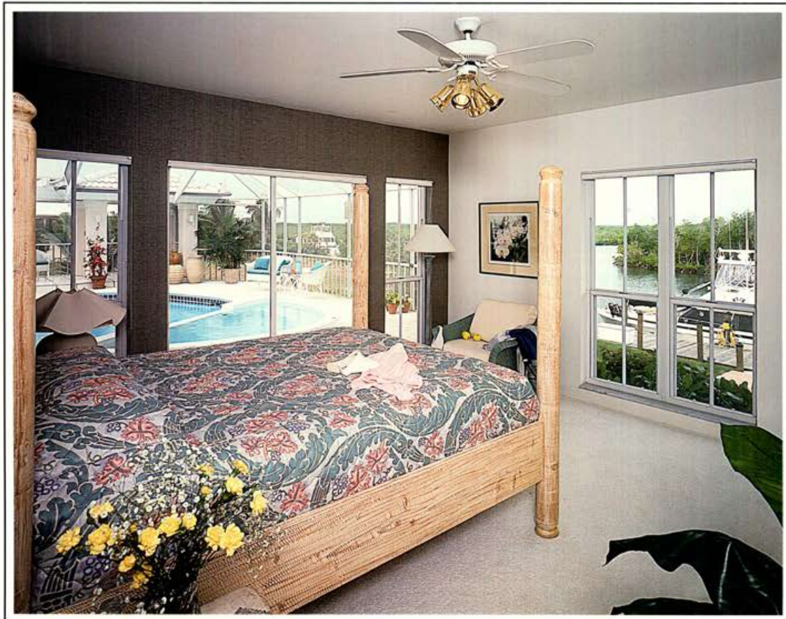
Revealing a vast panorama of outdoor scenery, the guest bedroom provides a magnificent setting for visitors.