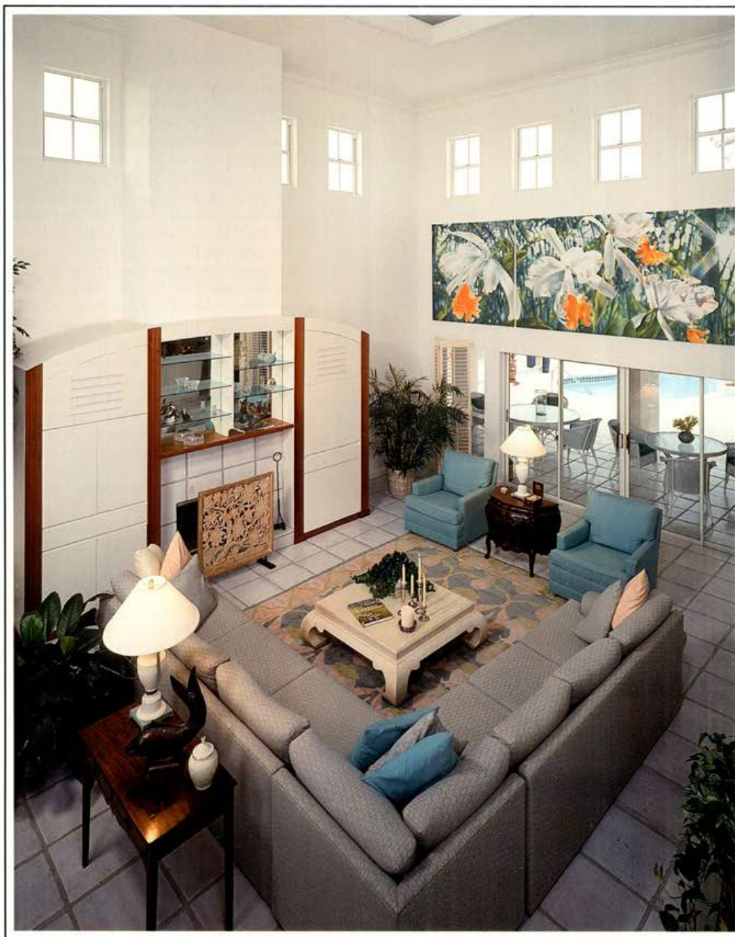
The fireplace is incorporated into a custom, built-in mahogany wall unit with display and storage space.

from the bedroom balcony which, from its vantage point high above, incorporates the sweeping vista of mangroves, native wildlife and water. It is difficult to imagine anyone who could not experience the exhilaration of this year-round, indoor-outdoor environment, designed to be comfortably enjoyed by family and guests ... and this is precisely what the present owners of the house felt when they first saw it. They had come from the Northeast and had lived in a beautiful, historic residence of tradi-