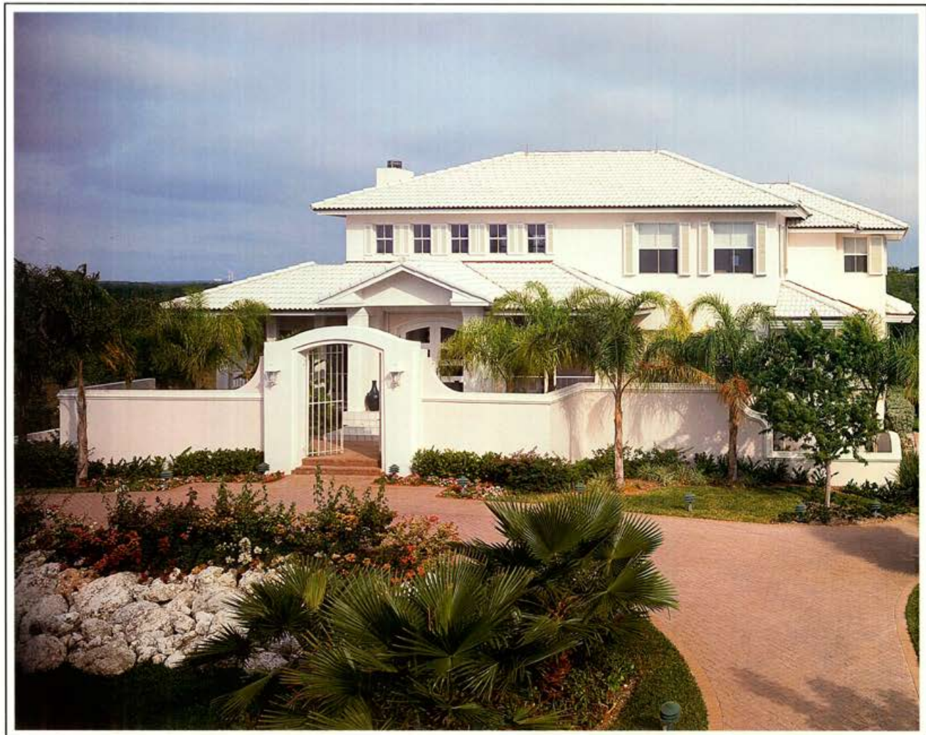
Architectural elements reflect those found predominantly in the Caribbean with strong influence of European colonial style.

Coastal Construction Co., General Contractor Smith Hammock Landscape, Landscape Architecture