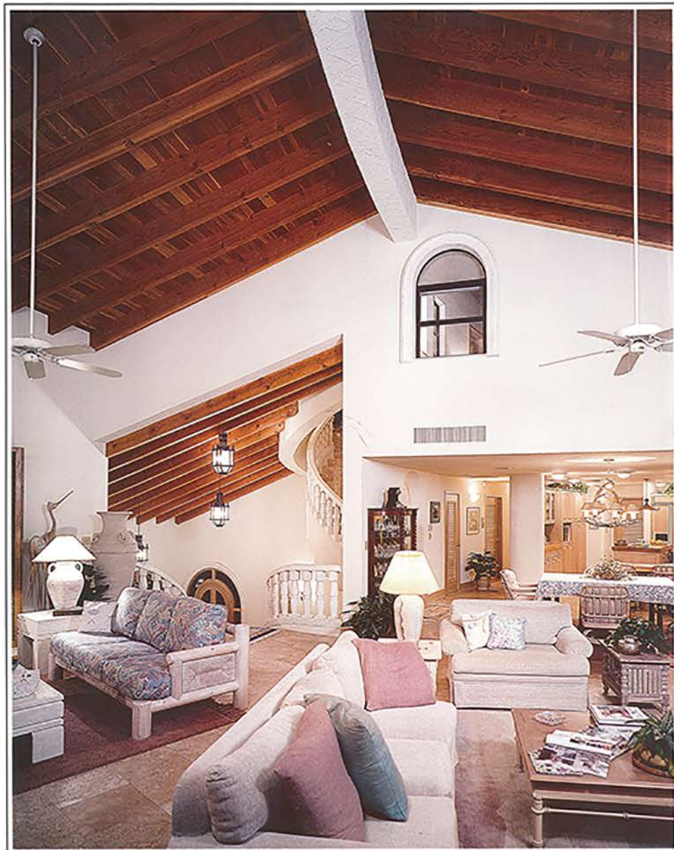
Bowed, stucco ceiling beam reveals the subtle curvature of the living expanse. Wood beams mixed with the stucco give a Mexican flavor.