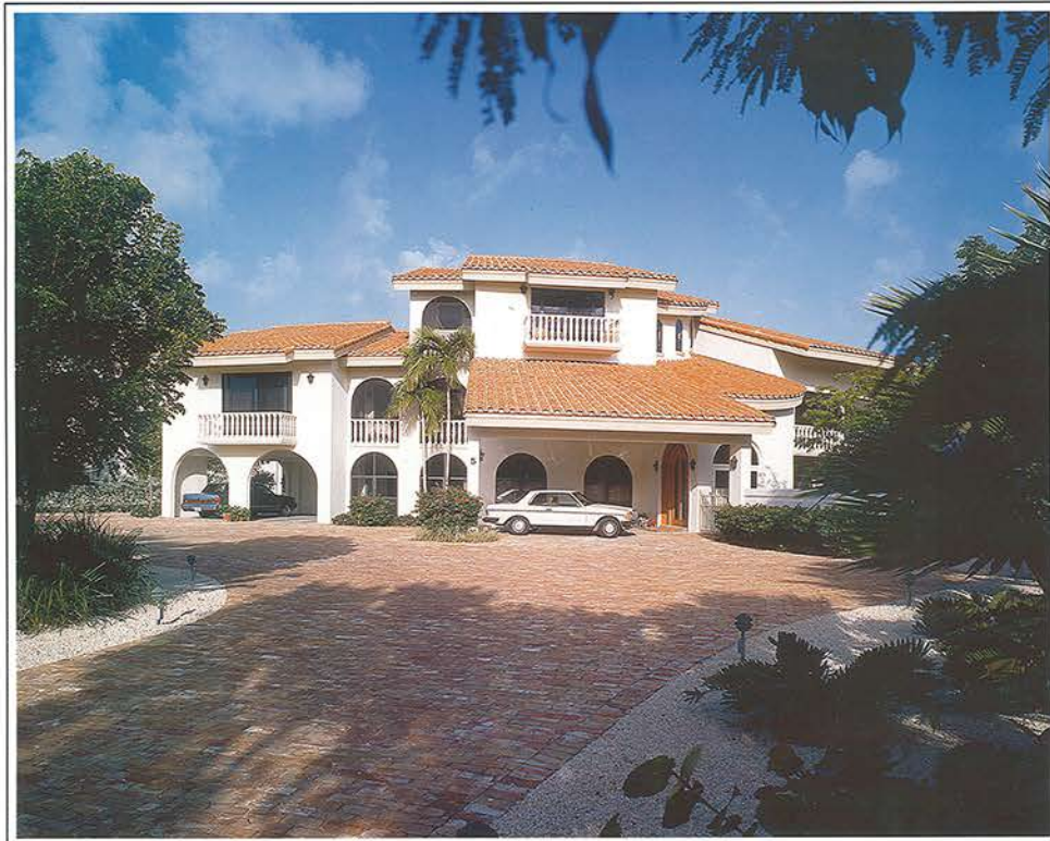
A circular brick driveway leads to the Southwestern-style house where adobe arches and balconies rhythmically follow the flowing design.

simple one but by curving it, the house takes on a dimension of grandeur. While this curvature creates a striking visual statement and became the design solution for the project, it also created an enormous challenge for the general contractor. The entire house – every room and wall, the arches, the beams – consists of curves and angles. Even on the roof, each and every piece of barrel tile had to be cut into a pie shape to fit the peak of the curve. This enormous undertaking required extraordinary competence, and it was triumphantly accomplished by general contractor Coastal Construction Company. The insistence upon unsurpassed standards of quality defines the belief by which Coastal Construction operates. This commitment combined with years of experience enabled the company to successfully achieve the demands of this project. A circular driveway of light, old Chicago-style brick leads to the house where adobe arches and balconies rhythmically follow the curvature of the design. Overhead, the roof is constructed with handmade, clay tiles. Southwestern in theme, the home blends timeless old-world with south Florida vernacular. Flood regulations in this area require first-