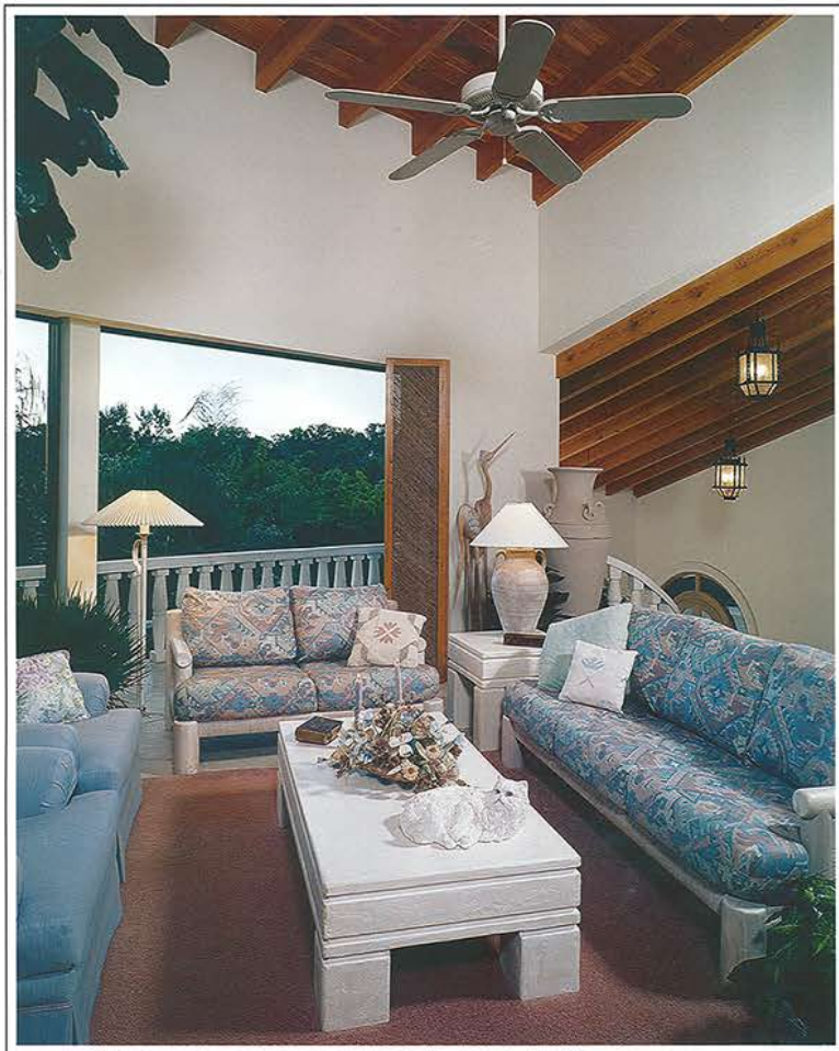
Rough lodgepole pine, Southwestern-style fabric and heavy stone tables add to the warm, Mexican feel.

Looking down from the second level, angles and lines and archways create a scene of striking beauty.