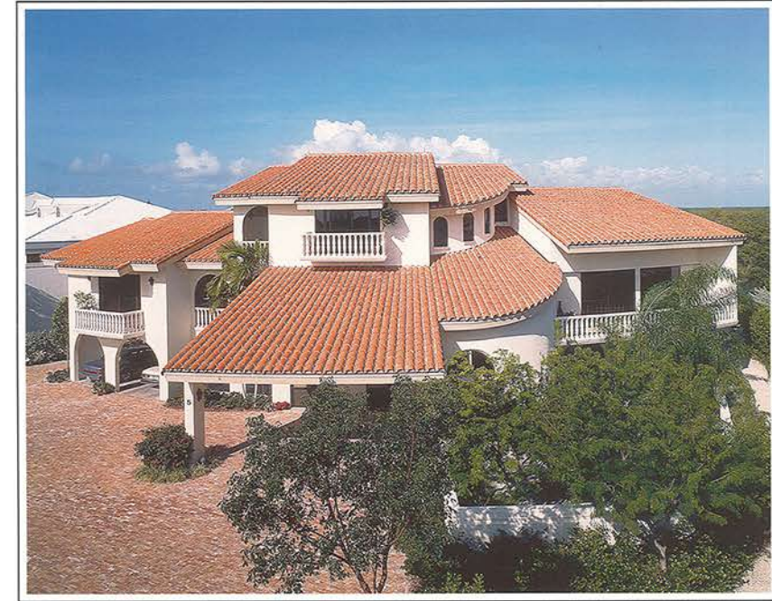
The arc-shaped design guides views away from the street and neighbors, directing them instead towards the water.