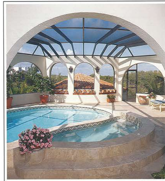
Archways divide a covered patio from the screened swimming pool and spa area.