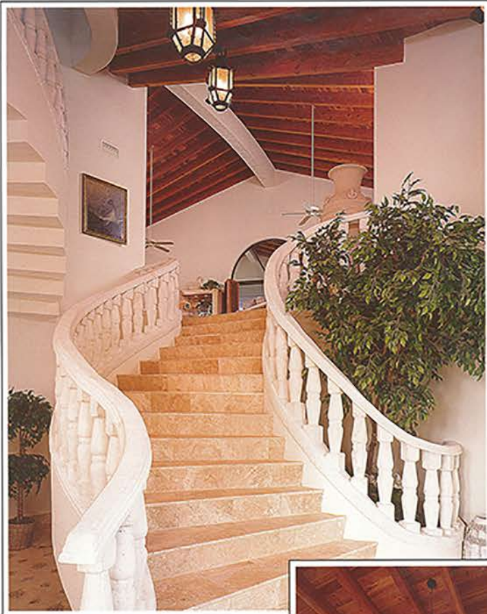
A winding stairway with travertine steps and curving, cast stone railings sets a tone of graceful elegance.