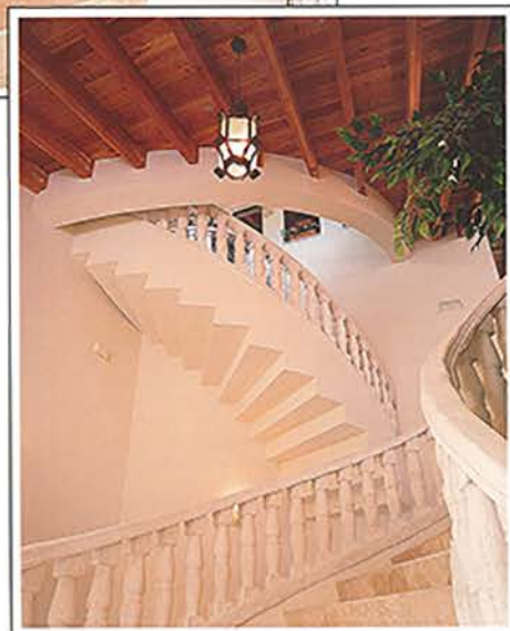
An interplay of curves and forms creates exciting visual interest.