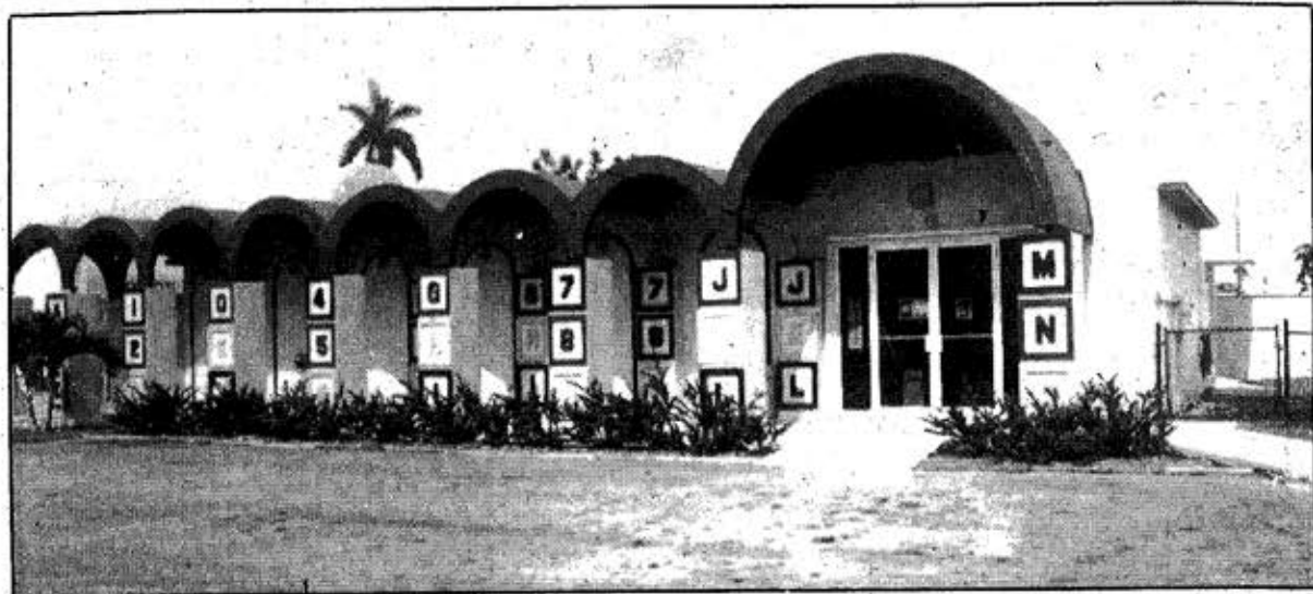
AWARD WINNER — LeJardin Community Center.